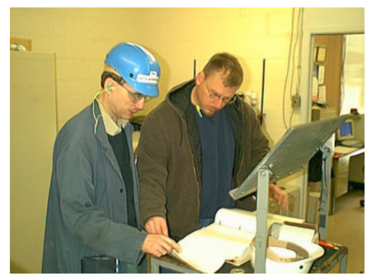
A McGill AirClean field engineer reviews a project with a customer.

The McGill AirClean PMP program combines the two approaches to maximize the efficiency of your efforts. We provide you with a preventive maintenance schedule, a report on the current condition of your equipment based on collected data, and a predictive maintenance plan. A central database will be established to store all maintenance information.